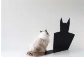
A random cat

You often hear of dogs protecting farm animals from coyotes, but have you heard of a cat doing the same?