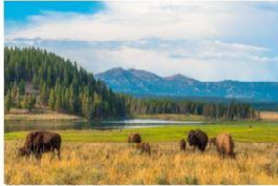
Yellowstone Park: A family of bison grazing

The tourist was airlifted to the nearest hospital. They are in critical condition. Park officials say that before entering the park, visitors are given a lesson on how to behave inside the park.