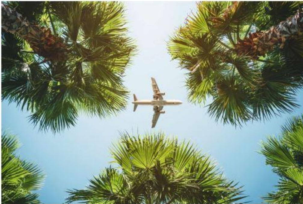
Flying High: An airplane takes off from St. Pete-Clearwater International Airport