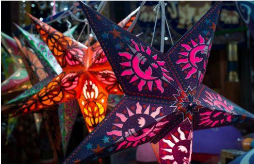
Stars: Lanterns shaped like stars for Lunar New Year