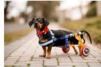
Dixie with wheels

Dixie became paralyzed and now uses a wheelchair. Dixie's owner says she plans to take the other dog owner to court.